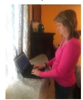
Neck pain due monitor too low