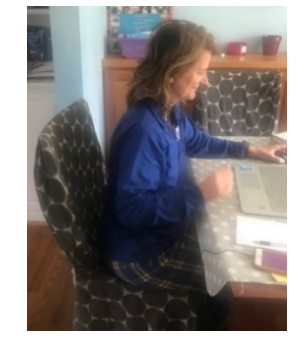
Back pain due to no lumbar support and wrist pain due to hard sharp table corner

Fix: Create a sense of work and social community by connecting with co-workers for informal chats and sharing personal stories about working at home, connect daily with friends/family